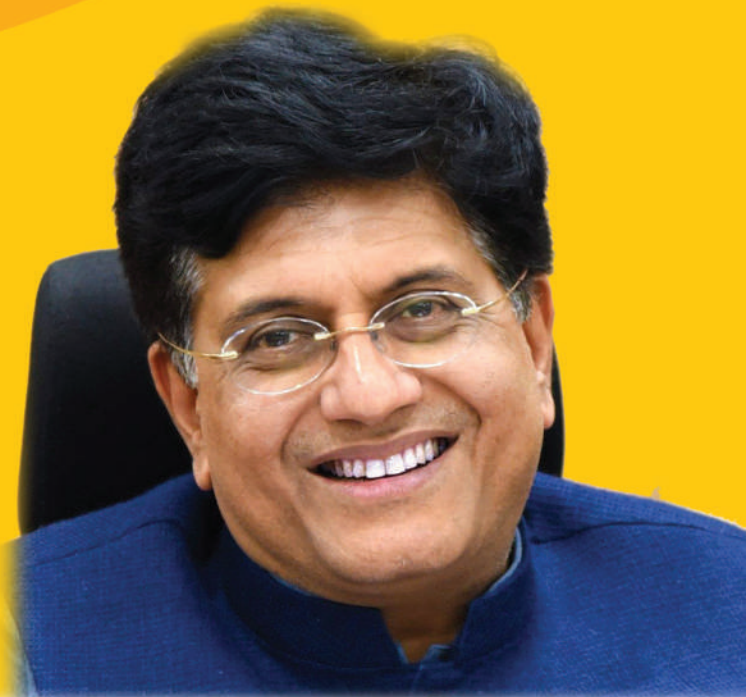
Shri Piyush Goyal

Hon'ble Minister of Commerce and Industry & Minister of Railways & Minister of Consumer Affairs, Food and Public Distribution